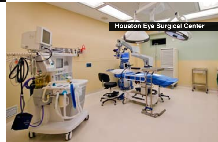
Houston Eye Surgical Center