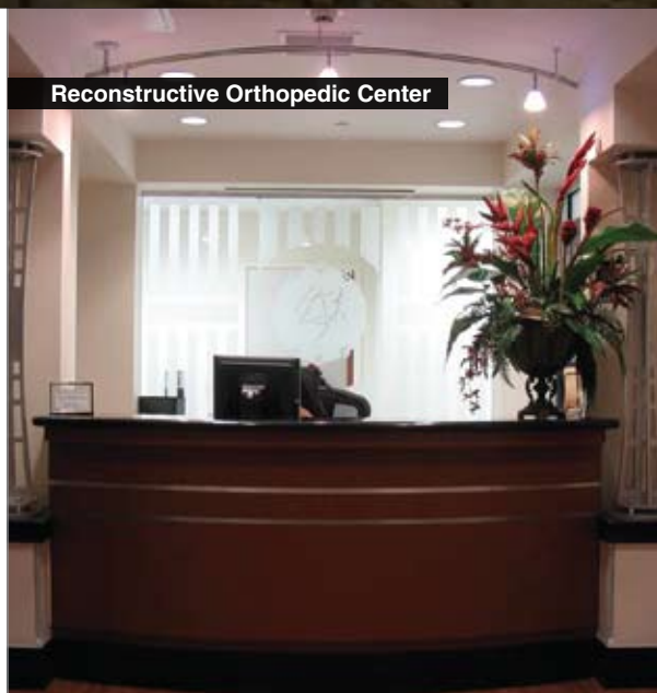
Reconstructive Orthopedic Center