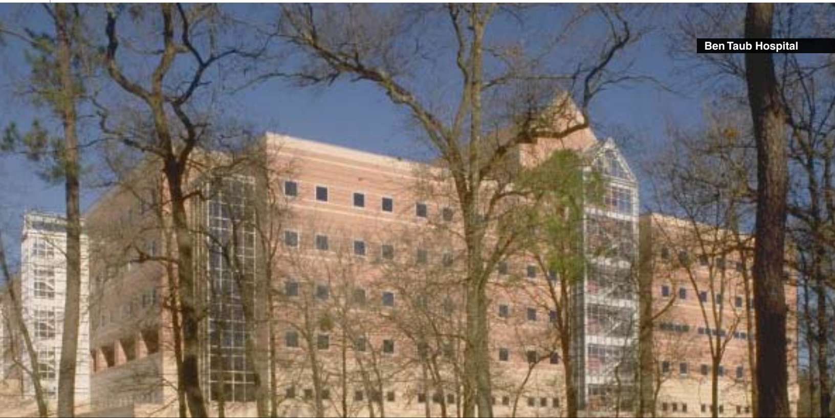
Ben Taub Hospital