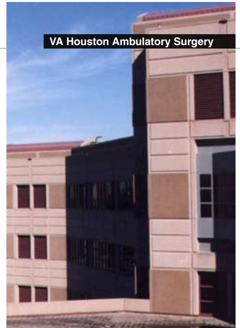
VA Houston Ambulatory Surgery

We have the ability to bring a multi-disciplined team of planners, architects, management consultants and financial analysts together. In cooperation with our clients we search for appropriate solutions to the problems we face. This interaction fosters work that is both practical and innovative.