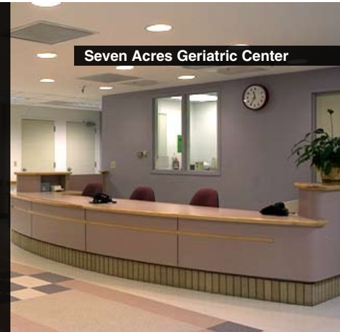
Seven Acres Geriatric Center