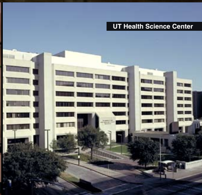
UT Health Science Center