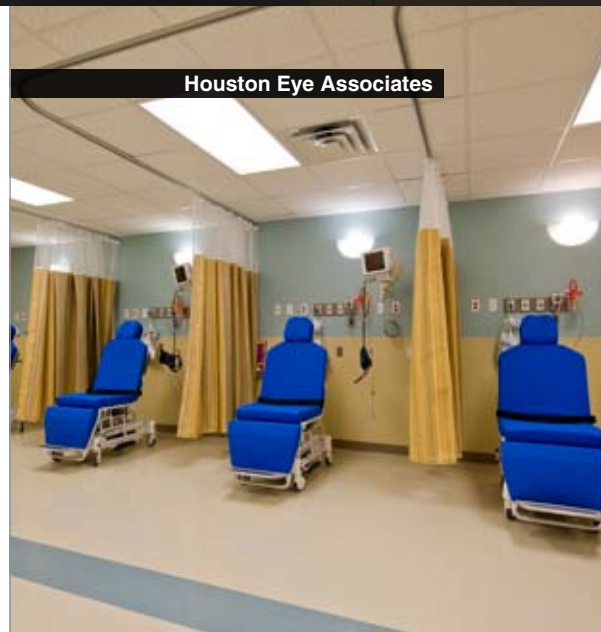
Houston Eye Associates