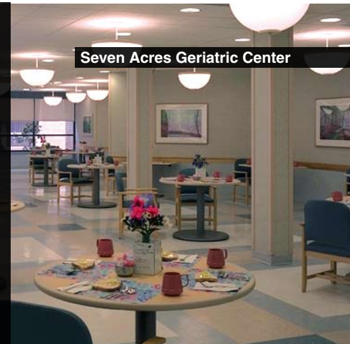
Seven Acres Geriatric Center

Interior Architecture serves as a link between interior design and true architecture, incorporating structural and load bearing issues as well as the visual aspects of interior spaces.