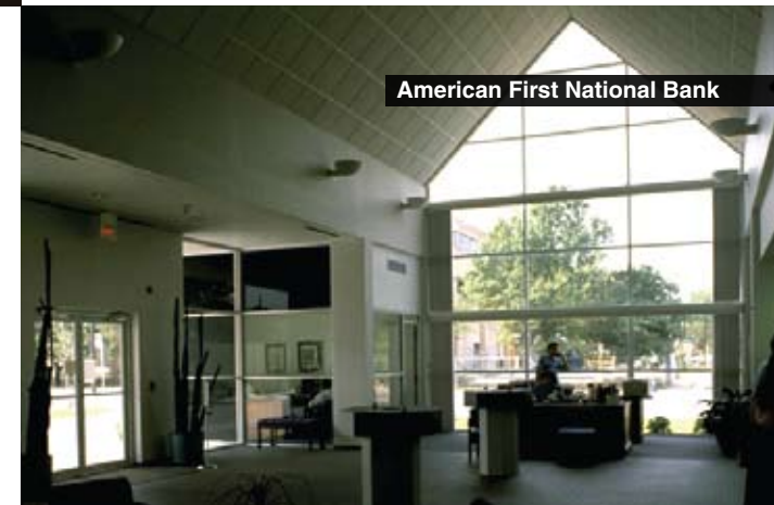
American First National Bank